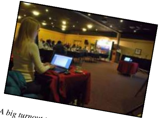
A big turnout to the Guidelines Implementation Workshop